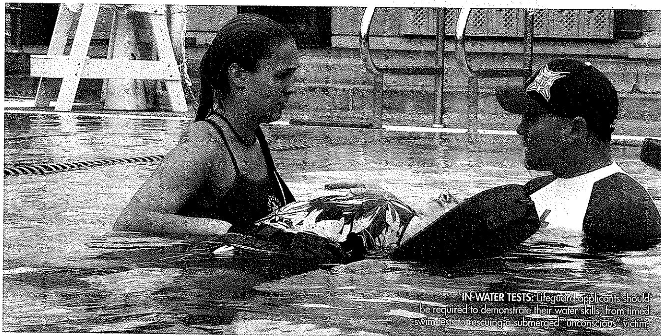
IN-WATER TESTS: Lifeguard applicants should be required to demonstrate their water skills, from timed swim tests to rescuing a submerged unconscious victim.

On the day of the skills and knowledge tests, the applicant's arrival time should be noted on their assessment sheet. The sheet should have areas that explain the skill, the name of the person who is evaluating the test and how the participant is rated. This could be a simple pass/fail event, a scored event, or a combination. Following are some examples of tests that could be used.