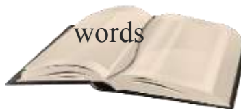
written in a book