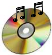
heard in a song

Documentation explains where borrowed words, statistics, ideas, pictures, charts, music, and other items came from.