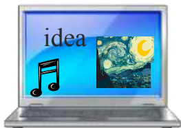
found on a website