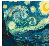
painted in a picture