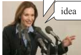
said in a speech