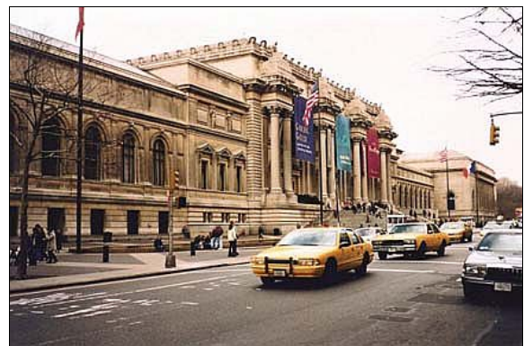
Metropolitan Museum in New York

The bus departs promptly from the MET at 8:00 PM so don't be late and or miss the bus. Busses in New York are not permitted to sit and park along the sides of streets so everyone needs to respect the bus schedule when it is announced.